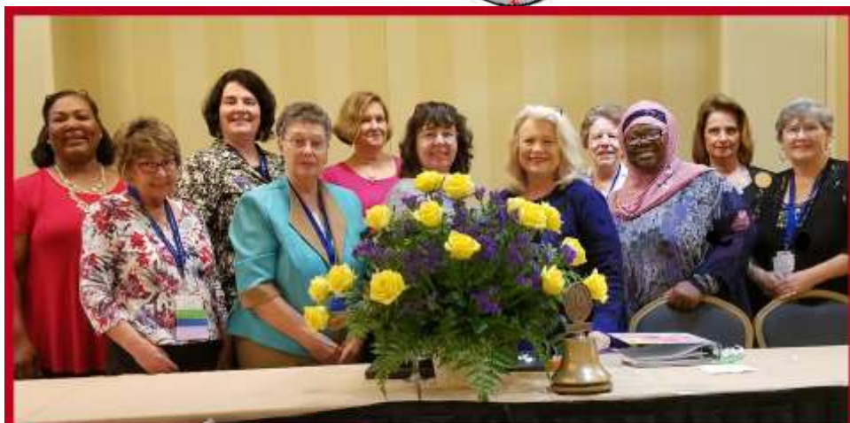
BPW/TN Past State Presidents