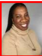
Special guest speaker Tarana Burke