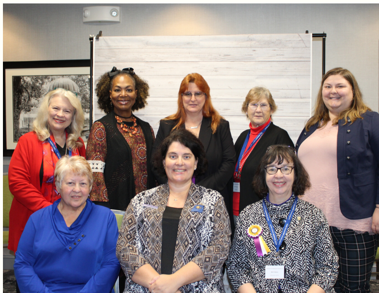
State Officers, Regional Directors, & Parliamentarian