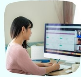
Post-Convention June 8th, 2023

Our 104 th Annual Convention is a hybrid of virtual and in person meetings this year. The Board of Directors and two of the convention meetings take place virtually using Zoom. The in person meeting takes place at the Hampton Inn and Suites in Mount Juliet. The day of the in person meeting, we will also have a Zoom meeting for anyone unable to attend in person.