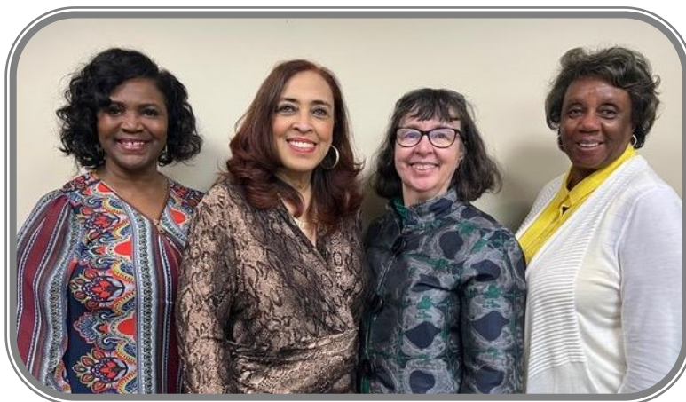
Jackson Area BPW 2023-24 Officers.