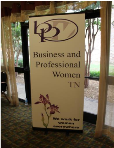
2014 BPW State Convention DoubleTree Hotel, Jackson, TN