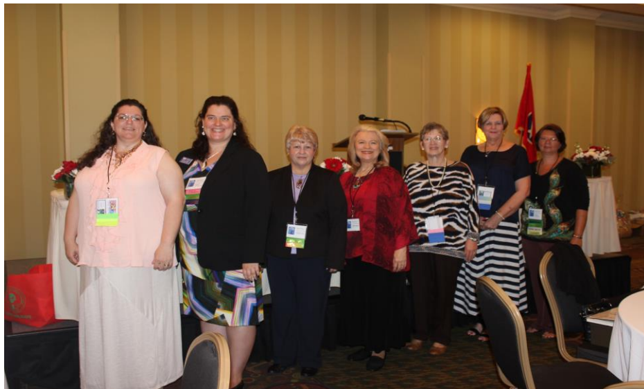
2014-2015 State Officers