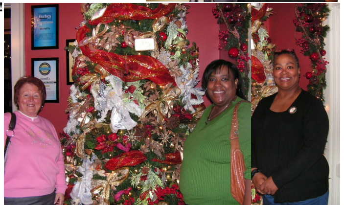
We had a great time at Monell's. The food was delicious and the decorations were beautiful.