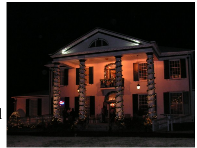
Monell's at the Manor

Our Holiday Event Saturday Dec. 1st. "The NashTrash Murder Mystery Dinner Tour" was very well attended with 14 BPW members from Greater Nashville BPW AND Franklin, KY BPW. We had a great time and dinner at Monell's was totally awesome and completely filling