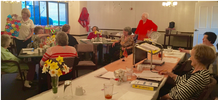
Eager bidders for one of the MANY items