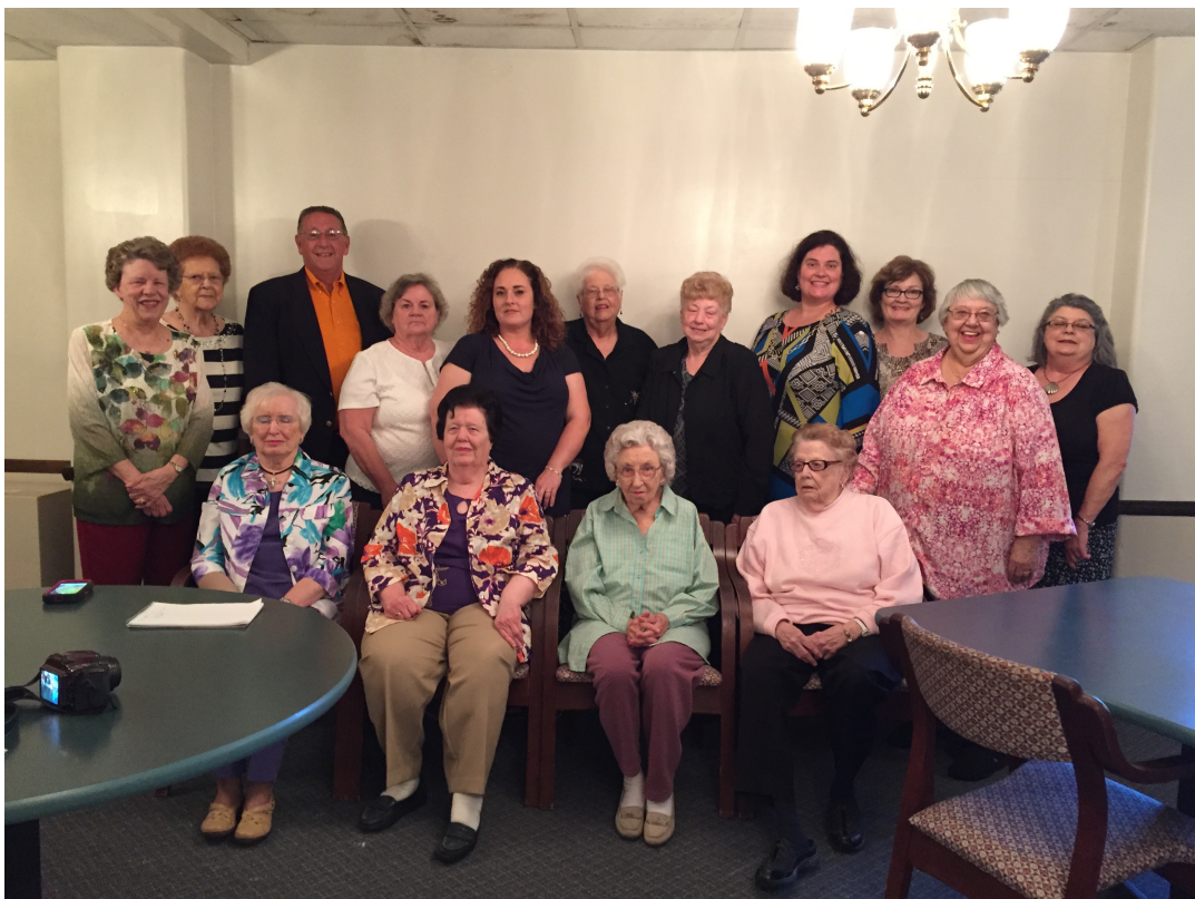
Rockwood BPW members and guests attend the National Business Women's Week/95th Anniversary meeting in October.